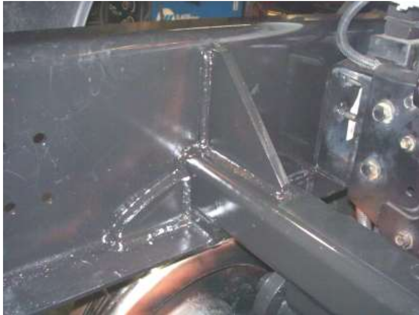
Figure 5. Circular Frame Extension Notch

A circular notch as shown in Figure 5 may be required in the passenger side frame extension to allow for wheel clearance in the stowed position