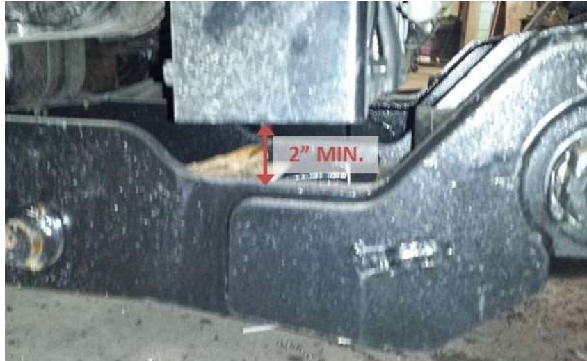
Figure 2. Long Arm Position and Radiator Clearance

To achieve the recommended installation position and radiator clearance, it is typically necessary to install the spring hangers onto the truck leaf springs ~6" in front of the truck front axle.