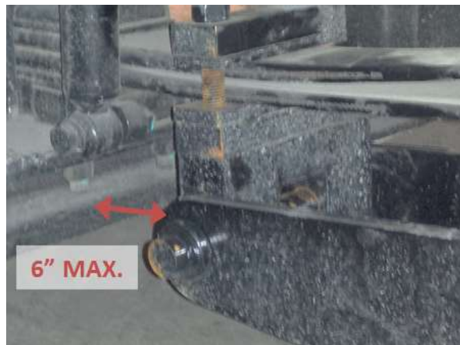
Figure 3. Typical Spring Hanger Location

To achieve the recommended installation position and radiator clearance, it is typically necessary to install the spring hangers onto the truck leaf springs ~6" in front of the truck front axle.